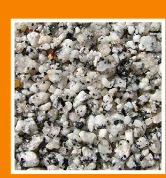
Speckled Grey Granite